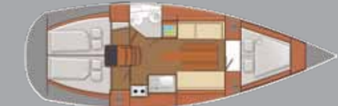
Interior 3-cabins navigation table