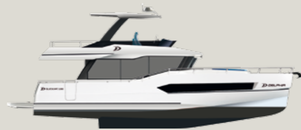
Side view - Flybridge