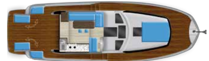
Deck view - opening aft