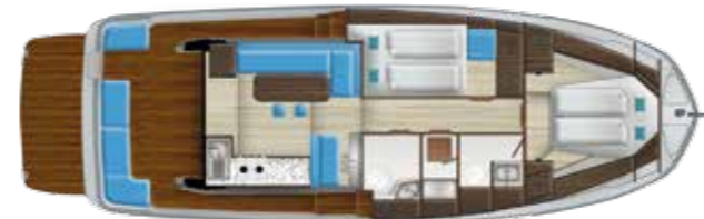
Interior - 2 cabins (option)