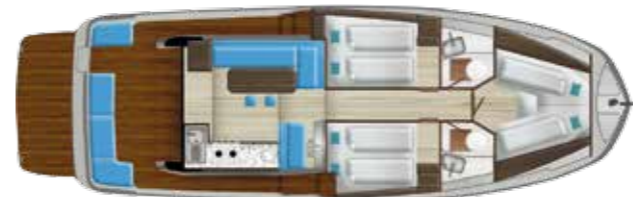
Interior - 3 cabins