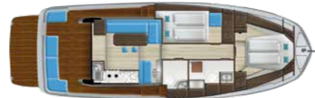
Interior - 2 cabins (standard)